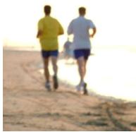
We're working for more exercise options and safer neighborhoods.

The West County HEAL Project is a policy change-focused program that aims to improve the health and quality of life for the residents of our three target areas: Richmond, North Richmond, and San Pablo, California.