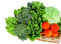
We're working with local businesses to increase their inventory of healthy foods

In probably the most over-arching of the four sectors, the community sector will create "oases of connectivity" -