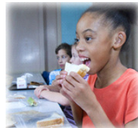
Our community's children deserve healthy choices in the school cafeteria.

Aside from merely educating and working to engage teachers in adopting healthy classroom food practices, we have a number of policy-change and standards goals we are looking to implement such as SB 12 and SB965 (the new state nutrition standards for food and beverages sold or served on school campuses) and increased physical activity standards for elementary and middle school students,